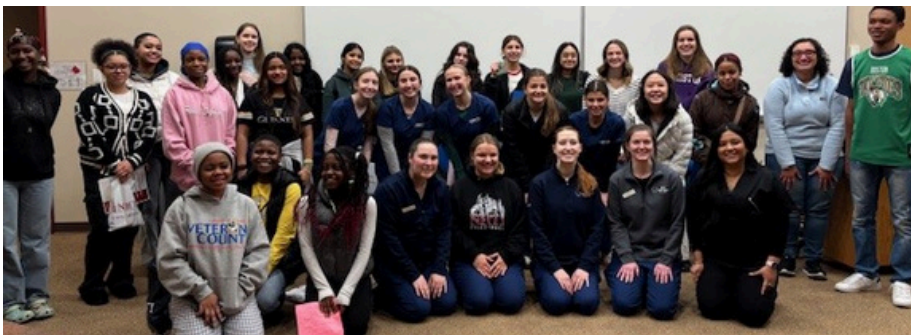
High school and dental students at field trip to NH Technology Institute.

From practicing proper brushing to building teeth models and even carving a tooth out of soap, students dove into every activity with curiosity and creativity. As the day progressed, many began to picture themselves in these careers, especially after hearing from a panel of NHTI dental students who answered thoughtful questions from the high-school participants. Most importantly, students discovered the wide range of oral-health career pathways available right here in New Hampshire, opening doors to futures they may not have known existed.