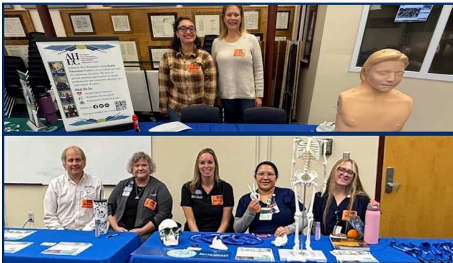
Vendors at Keene High School.

Students identified their top areas of interest as nursing; EMT/paramedic roles; physical or occupational therapy; and physician or physician assistant careers.