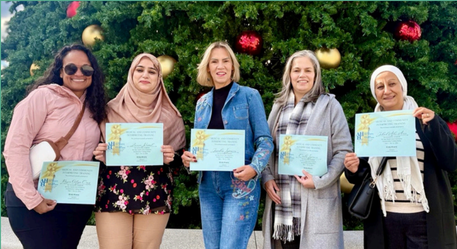
Interpretation fall 2025 graduating members with certificates.