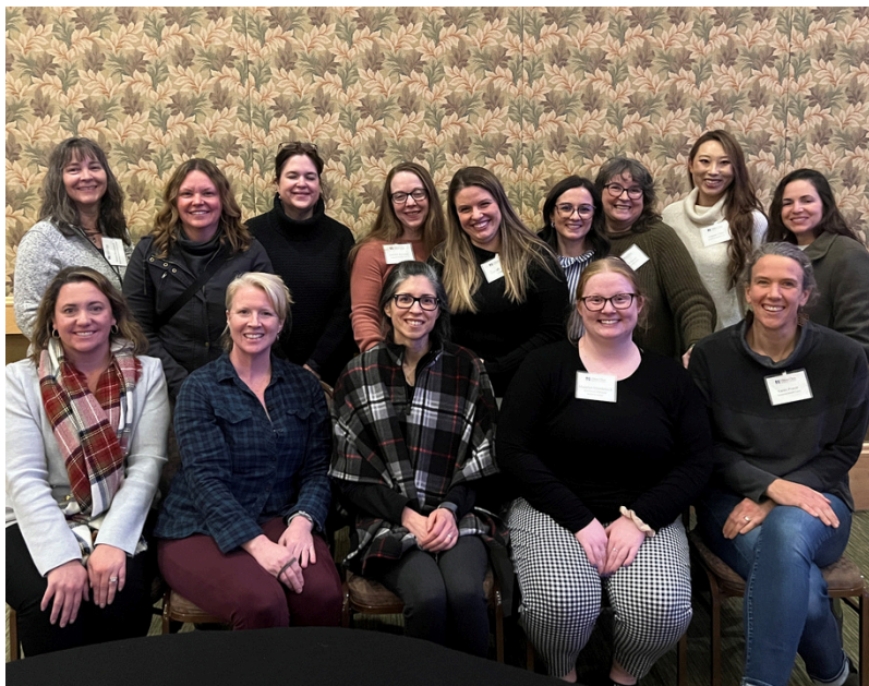
Fall 2024 Teaching for Tomorrow cohort

Southern NH AHEC had the opportunity to invite nursing preceptors to participate in Part 1 of Teaching for Tomorrow, a conference focused on teaching and learning. Our goal is to enhance skills to build the preceptor pipeline in NH. Preceptors are invaluable to the healthcare workforce as they prepare students for patient care by providing experiential learning opportunities. SNHAHEC received funding from the UMASS AHEC as part of the New England Nursing Preceptor Academy.