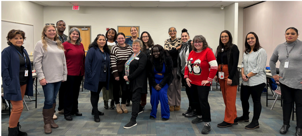
CHW Connect Attendees on December 10, 2024

CHWs joined together for networking and learning. We hosted a Team Based Care presentation offered by a panel of CHWs who talked about strategies for integrating CHWs within care teams. CHWs also received updates on the process for legislative rule-making for CHW Certification, the roll out of the new CHW Employer Survey, and upcoming CHW Focus groups. CHWs shared their thoughts about how to describe a CHW in three words. Click here to view the video and other highlights captured from CHWs.