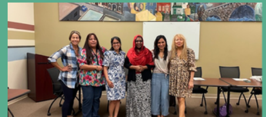
Last spring's Interpreter class