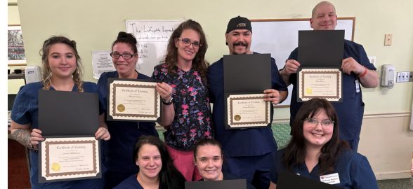
Graduates from North Countries LNA class