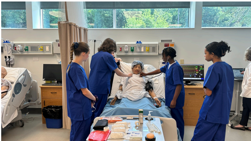
2023 Camp participants learning to take vitals at a simlab.

The purpose of AHEC youth programming is to build the health career pipeline, exposing youth to the wide variety of career opportunities within the healthcare field. Our intention is to develop nurses and behavioral health professionals from diverse cultures in order to increase the cultural effectiveness of health care organizations, and increase the diversity of the health career workforce.